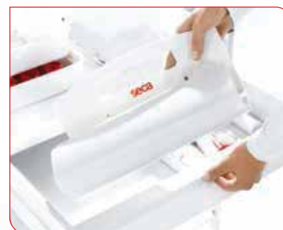
The measuring mat can be rolled up for space-saving storage.