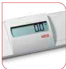
The patient's BMI can be determined when their height is entered.

The low platform profile reduces patient effort and risk when stepping on the scale. As the 22 x 22 inch platform is almost twice as large as that of a normal scale, a chair may also be placed on the scale for weighing a patient. With the pre-TARE function, the weight of a chair or standing aid can simply be tared away. Up to 3 TARE weights (e.g. chair weights) can be stored.