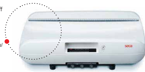
Thanks to the additional measuring tape, the seca 727 enables a precise measurement of the baby's length.

With the seca 360° wireless technology, the seca 727 can transmit measurements to the optional seca 360° wireless digital printer. With the network-capable software solutions seca analytics 115 or seca emr flash 101 and wireless USB adapter seca 456, your PC can receive and analyze measurements and forward them to an Electronic Medical Record (EMR) system. The seca 727 is EMR integrated, ready to handle digital patient records and all the demands the future will bring. For more information about EMR integration, visit: www.seca.com .