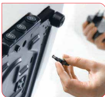
Can be operated by battery or power adapter.