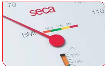
It is easy to determine BMI with the colorcoded dial.