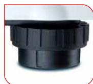
Leveling base on the bottom of the scale base for safe and secure placement.