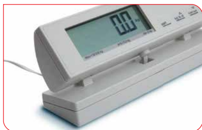
Infinitely adjustable tilt angle in display and operating element for installation on a desk or wall.