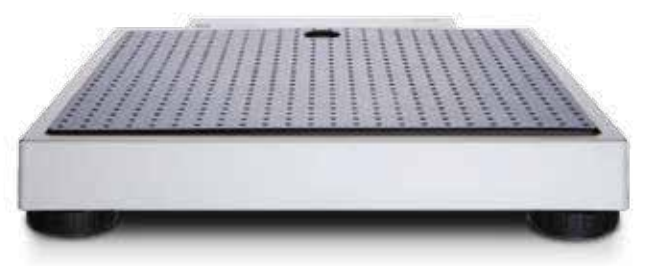
The flat design and slip-proof surface ensure easy access and a secure stance.