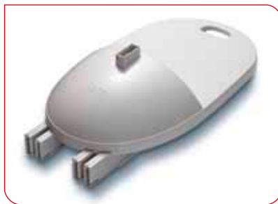
Integrated handle and secure catches on all individual parts for transport ease.