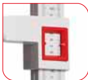
Two large windows and double-sided scale for easy readout.