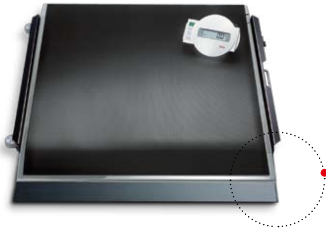
A ramp for easy roll-on of wheelchair is included in delivery.